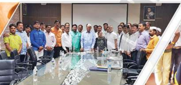
In meeting with Native Bull owners and Commissioner of Animal Husbandry, Maharashtra State discussing mitigation in cruelties in Bull Race.