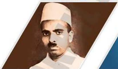
SHRI DHEBAR BHAI Freedom fighter 1937