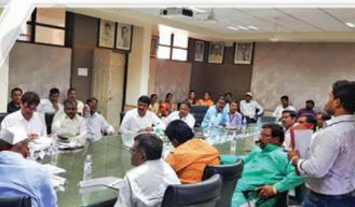
Meeting with Maharashtra State official over Maharashtra Animal Preservation Act implementation in the State.