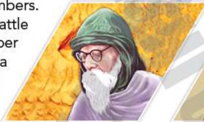
ACHARYA VINOBA BHAVE

Legendry Founder, Past Presidents and Trustees of AKHIL BHARAT KRISHI GO SEVA SANGH