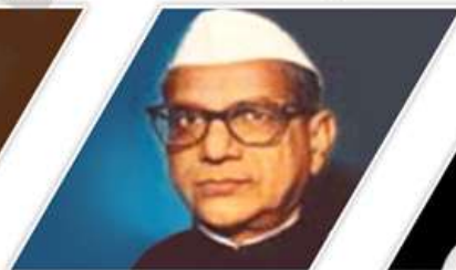
SHRIMAN NARAYAN Ex Governor of Gujarat