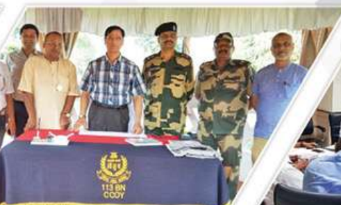
Indo Bangladesh border visit to survey cattle Smuggling with BSF stalwarts.