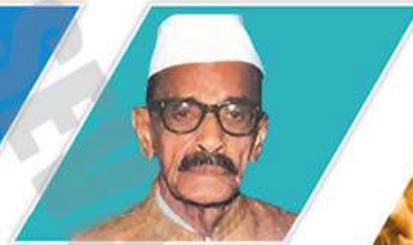
GULZARILAL NANDA Ex- Prime Minister of India