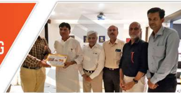
Delegating Live Animal Export issue with Hon. Shipping Minister Shri Mansukh Bhai Mandavia.