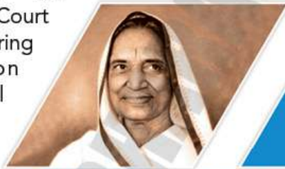
PADMABHUSHAN JANKIDEVI BAJAJ