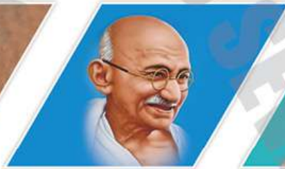
RASHTRAPITA MAHATMA GANDHIJI Founder Of Organisation 1928