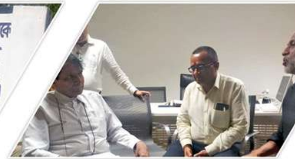
Meeting with Hon. Minister Shri Suresh Prabhu to apprise irregularities in Export of Live Animal.