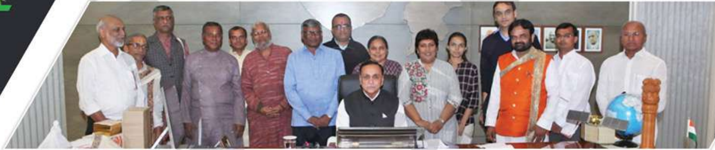
Gratitude Meeting with Hon.C.M. of Gujarat for announcing major relife to Gausihala of Gujarat.