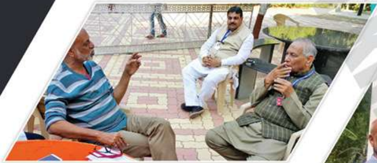
Discussing Meat Export policy of India with international president of VHP, Ex H.C. Judge Shri V.K Kokjeji